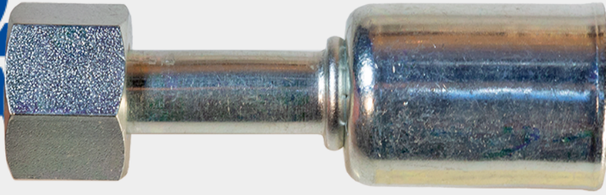
Straight o-ring female fitting